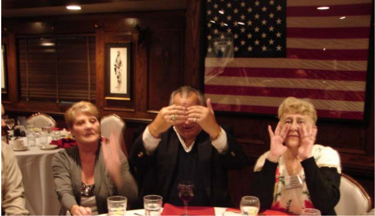
Signal no evil, see no evil, shout no evil